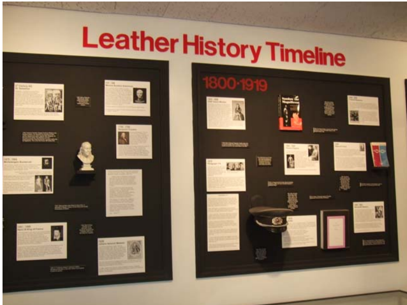
The Leather Archives and a section of the Leather History Timeline in the Museum.