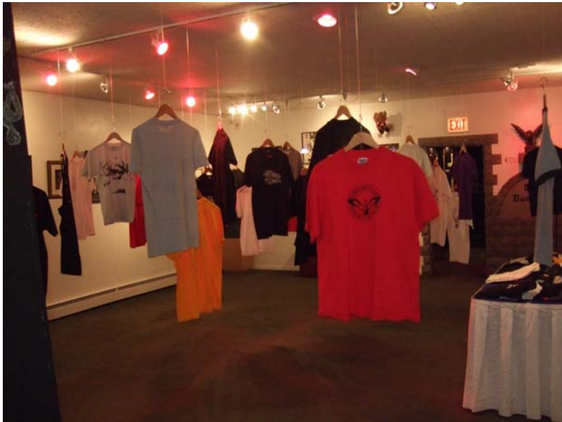
A 1,200 T-shirt collection representing various events throughout the country over the last 50 years.

Published February 18, 2009 in vol. 3, iss. 4 [ View ]